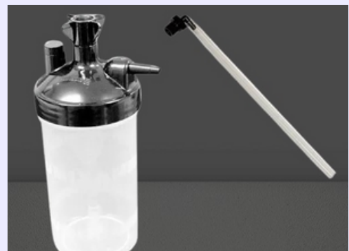
HUMIDIFIER BOTTLE FOR PHILIPS WITH CONN.