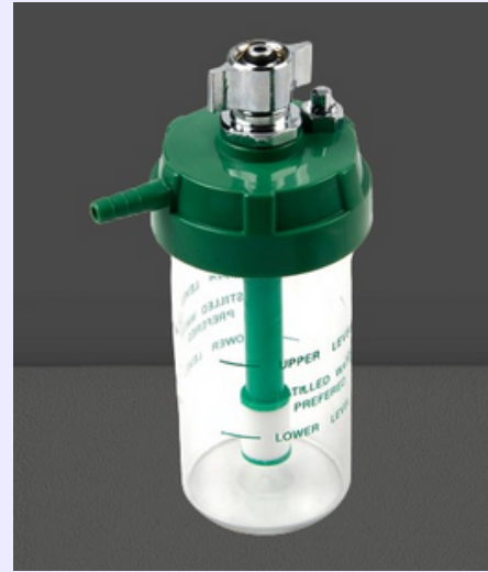
HUMIDIFIER BOTTLE FOR DYNMED 10ltr MACHINE